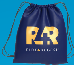
Awesome R4R Bag