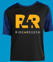
R4R Sports T-shirt