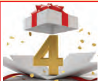
4 PRIZES- 1 FROM EACH OF THE FIRST 4 LEVELS