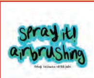
PERSONALIZED AIRBRUSH TOWEL