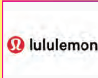
LULU LEMON CAMERA CASE