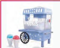
SNOW CONE MAKER