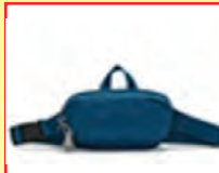
KIPLING FANNY PACK