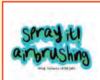
PERSONALIZED AIRBRUSH SWEATSHIRT